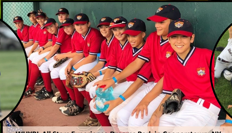
WHYBL All Stars Experience Dreams Park in Cooperstown, NY