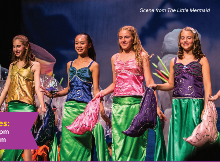
Scene from The Little Mermaid